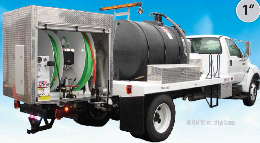
HD 7844TMC with Jet Eye Camera